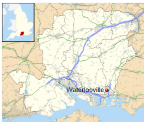
Location within Hampshire

Waterlooville is twinned with Maurepas, Yvelines in France and Henstedt-Ulzburg in Germany.